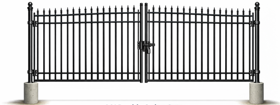
20' Double Swing Gate

Includes heavy duty hinges, latch and lock